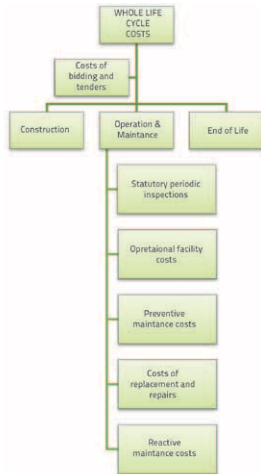
Figure 2 Whole life cycle costs structure [2, 20]

The data required to carry out the life cycle costing analysis are categorized in Figure 3. These different data influence the life cycle costs at different stages of life cycle [21].