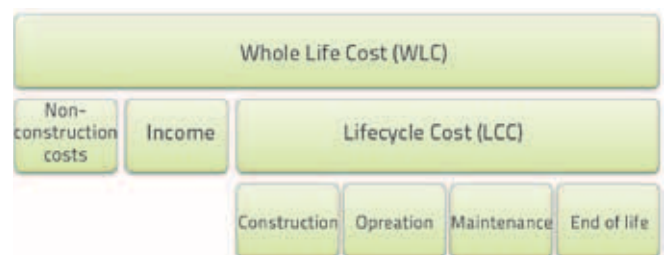
Figure 1. Whole life cycle cost and life cycle cost structure [16]

It is considered that two major obstacles prevent a broader use of the life cycle cost method. These are the lack of reliable data on historical costs and building operating characteristics, and the absence of effective methods for controlling the cost analysis [17]. The collection and processing of data is extremely difficult because buildings are dissimilar, and are located in different areas, built at different times, and operated by a variety of owners and their agents. Cost data are therefore difficult to collect and analyze, and there is no institutional mechanism or a standard method for collecting and recording of data [11, 17-18].