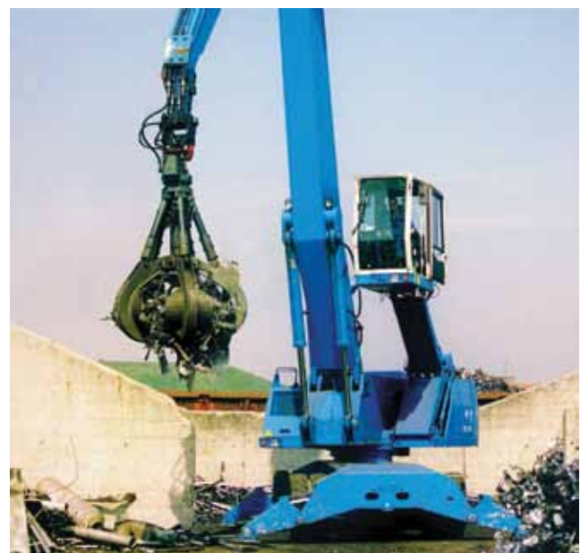
Picture 3. Working description of a clamshell grab during reload of the waste matters [7]

The height of the working area was estimated to be at least 15 m. For the achievement of the aforementioned capacity of 25.000 t/year (or 3,8 t/h), and also for the accommodation room for all three department of manufacturing process, it is necessary to obtain the clear ground area of 1500 m 2 with the minimum of 1000 m 2 of an additional ground area as an manipulative space. Municipal waste is directly transported into the reception hall where the reception basin is located. Above the basin is mounted the overhead travelling crane with a loader (clamshell grab). Clamshell grab is equipped with multiple jaws (positioned around the bucket) and it could be hydraulically powered. It is installed onto hydraulic crane and it's used as a mechanical arm for the collecting and transport of loose material and pieces in this particular case, of waste matters (Picture 3).