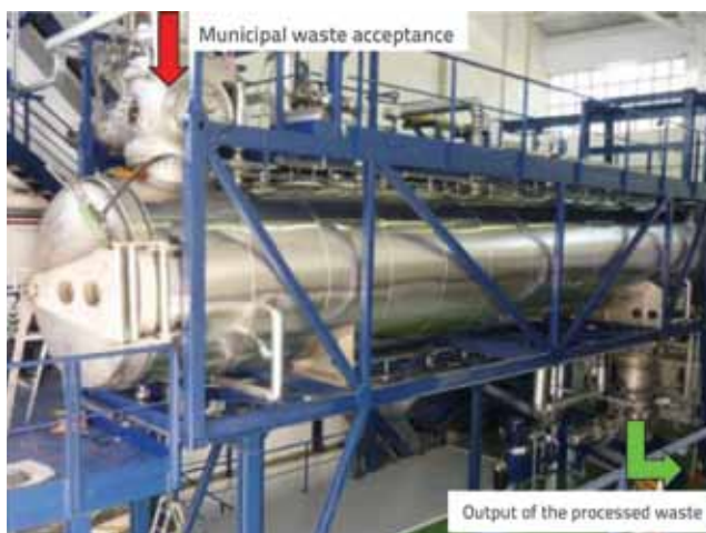
Picture 2. Facilities for the thermal waste processing, Geiserbox [6]

The height of the working area was estimated to be at least 15 m. For the achievement of the aforementioned capacity of 25.000 t/year (or 3,8 t/h), and also for the accommodation room for all three department of manufacturing process, it is necessary to obtain the clear ground area of 1500 m 2 with the minimum of 1000 m 2 of an additional ground area as an manipulative space. Municipal waste is directly transported into the reception hall where the reception basin is located. Above the basin is mounted the overhead travelling crane with a loader (clamshell grab). Clamshell grab is equipped with multiple jaws (positioned around the bucket) and it could be hydraulically powered. It is installed onto hydraulic crane and it's used as a mechanical arm for the collecting and transport of loose material and pieces in this particular case, of waste matters (Picture 3).