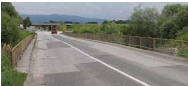
Figure 5. Pavement and railing, Bridge 1

Mode is a form of qualitative or quantitative property that occurs most frequently, i.e. a form of property with highest number of reiterations or with highest frequency. In case of nominal properties, the mode is defined by counting. For damage ratings with the reiteration frequency mode for more than one half of 15 respondents ( f \geq 8 ), the correspondence was registered in 62 % of the total number of elements under study. Considering the odd sample of respondents, if the limit of the reiteration frequency mode is reduced to ( f \geq 7 ), the correspondence amounts to satisfactory 75% for the total number of elements under study. Inspectors mostly agree with one another with regard to visible manifestations of greater defects.