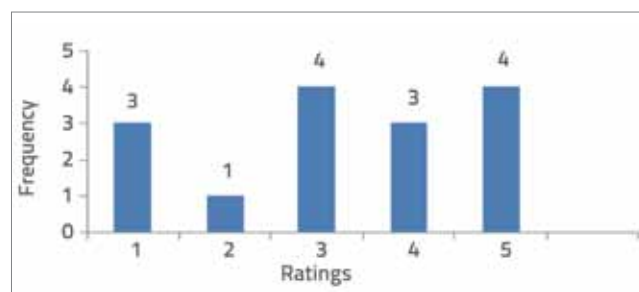
Figure 3. Distribution of ratings for abutment and pier foundations (Bridge 1)

An exceptional damage to abutment and pier foundations in case of bridge 1 shows the dispersion of results of 1.5 (Figure 3). This deviation is typical for the problem of perception: the elements under study (foundations) can not be inspected (Figure 4), but the condition of the entire structure points to the problem of scouring in the riverbed, i.e. to the mechanism that is not visible on the element itself (pier), but can be determined via deformation that can be seen by naked eye at the railing line (Figure 5).