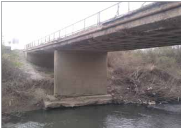
Figure 4. Bridge 1 abutments and piers at the time of inspection, with visible signs of scouring

a way that one half or ratings in the group has a value greater than the median, while the other half of ratings in the group has a value smaller than the median. According to the data, it is clear that the distribution of results according to standard deviation meets the condition of \sigma < 1.0 for the group of damage ratings according to median 4 and 5 which represent considerable damage to the elements, i.e. their full uselessness. This means that one half of the damage presenting considerable threat to the structure was assessed within limits of the level of damage for one higher/lower rating. This data shows a satisfactory accuracy for visual observation which has been divided in this study into five levels.